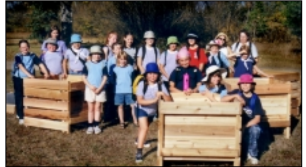
Regina Area Girl Guides

One active group, the Regina Area Girl Guides, now have nine of the senior Girl Guide executives certified as Master Composters by the Saskatchewan Waste Reduction Council and are currently training their Guides (1,200 girls). Working together the city and the Girl Guides have provided free online instructions on how to build your own compost bin ( www.cityregina.com ).